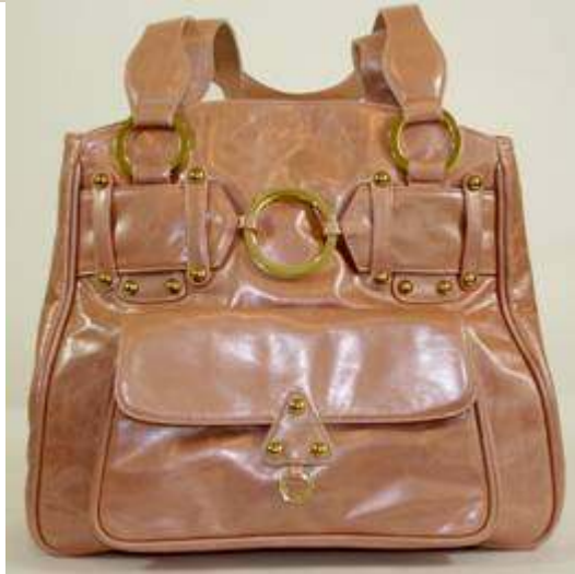
Left to right: Tessa ($286) and Isadora ($360) styles in Blush.

Krina handbags is donating 10 percent of profits from their pink “Blush” colored Isadora and Tessa bags to breast cancer charities.